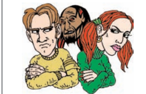
Demonic Misperception Causes Relational Estrangement

es and escape from the trap of the devil, who has taken them captive to do his will" (2Timothy 2:26; see also Revelation 13:7).