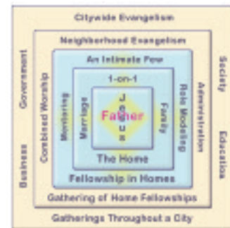
The Restoration Diagram Relational Priorities of the Earliest Church

If our Hebraic forefathers in the faith who first put their trust in Jesus could talk with Hellenist-influenced Christians today, they'd find nothing in common. The demonic influence of Hellenism is very powerful. It has deluded many into priorities and religious forms that have nothing to do with truly following Jesus.