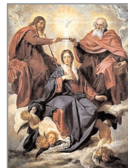
Mary being crowned Queen of Heaven by the Father, Son and Holy Spirit.

Worship of the Egyptian goddess Isis is threaded throughout Catholic ritual and worship through emphasis on a counterfeit Mary that bears no resemblance to the biblical presentation. Under the arrogant influence of the demonic Queen of Heaven principality, the institution of Catholicism proclaimed Mary to be the mother of God ( Theotokos ). The vast majority of Bible-believing Christians, however, recognize the authentic Mary as the mother of Christ in His humanity ( Christotokos ). When the proclamation of Mary as the mother of God became broadly accepted throughout Catholicism, the Queen of Heaven demonic spirit inspired artwork to demonstrate that the Godhead acknowledged her royal position .