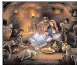
A typical nativity scene displayed at Christmas.

As sentimental as nativity scenes are, have you ever considered the image of Jesus they perpetuate in His helpless dependence on His mother? How many adult birthdays have you attended where people focused on the person as a baby rather than celebrating where they’ve come to in life and what they’ve achieved thus far?