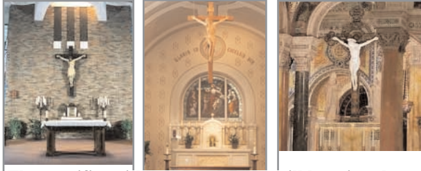
The crucifix, with our Lord Jesus still hanging there, is a daily reminder at every Mass that His sacrifice is not sufficient for salvation.

cient for salvation. Every time a Catholic attends Mass, he or she faces an indelible visual reminder of the insufficiency of Jesus' atonement on the cross.