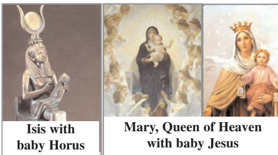
Isis with baby Horus