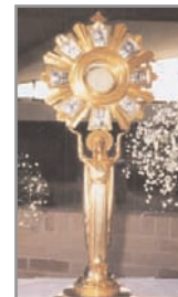
The Eucharist host is contained within the symbol of the sun god, and is held aloft by the Queen of Heaven.

appreciating what Jesus has already done once and for all time. Again, visual images adapted from