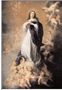
Commemorating the immaculate conception of Mary.

moment Mary was conceived: that she was supposedly kept free of original sin and was filled with sanctifying grace . Note that this feast has nothing to do with Jesus. Rather, the Immaculate Conception refers to the conception of Mary by her mother. That's why Mary is often called the Immaculata (the