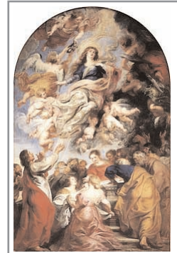
The Assumption of the Virgin Mary

In 1950 Pope Pius XII established the Feast of the Assumption ( revisionism ) to commemorate the death of Mary and her bodily assumption into Heaven before her body could begin to decay. Because it signifies her passing into eternal life, it is the most important of all Marian feasts and a Holy Day of Obligation for Catholics. This day also commemorates Mary's coronation as Queen of Heaven .